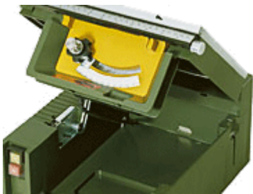
Table and drive can be lifted up and supported like an engine bonnet. For cleaning the device and easy saw blade replacement.

Non-slotted sawing cap cover of ABS for tight tolerances between saw blade and table (is slotted from below by the FET saw blade). For cutting very small parts.