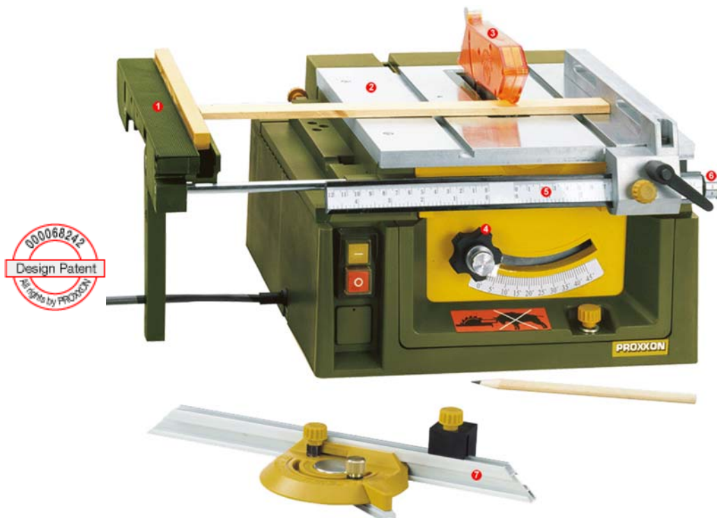
Table saw FET

For precise, straight cuts without refinishing! With micro-adjustable longitudinal stop.